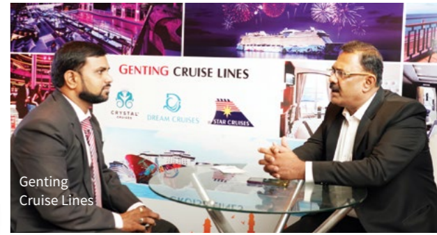
Genting Cruise Lines