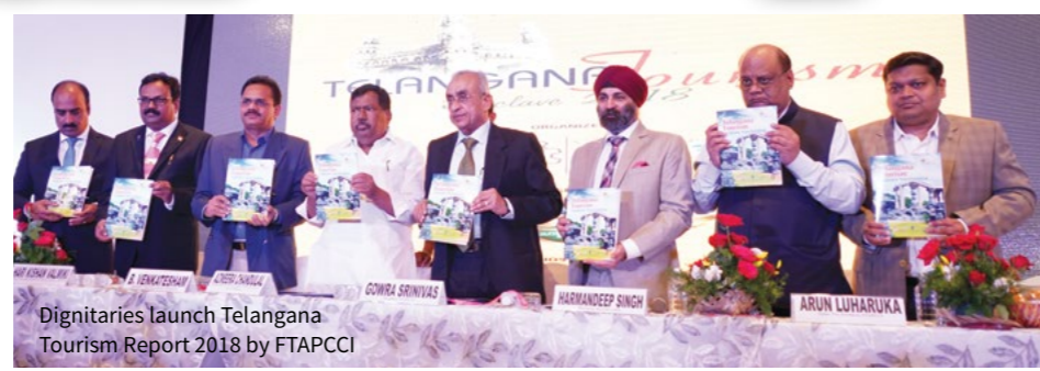
Dignitaries launch Telangana Tourism Report 2018 by FTAPCCI