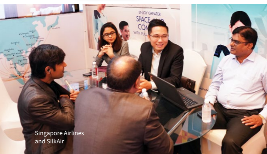
Singapore Airlines and SilkAir