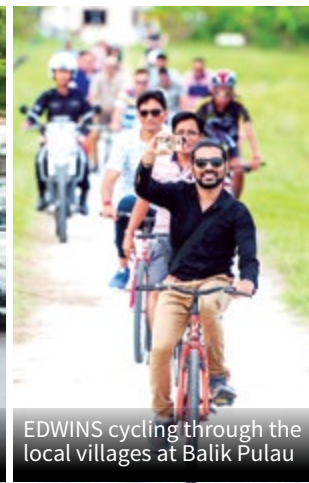
EDWINS cycling through the local villages at Balik Pulau