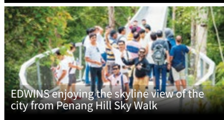
EDWINS enjoying the skyline view of the city from Penang Hill Sky Walk