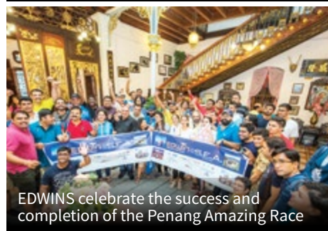
EDWINS celebrate the success and completion of the Penang Amazing Race