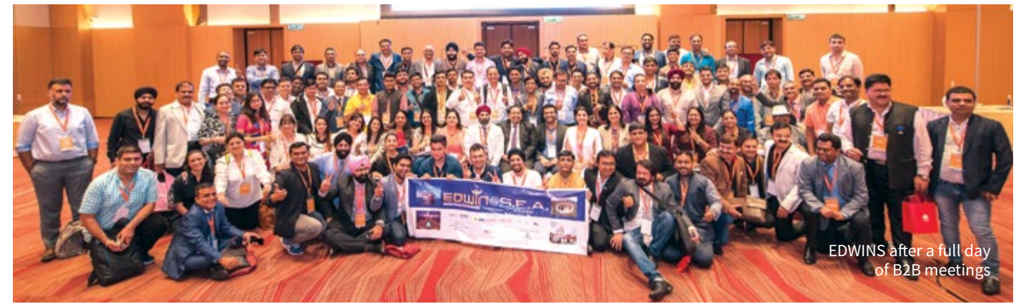
EDWINS after a full day of B2B meetings