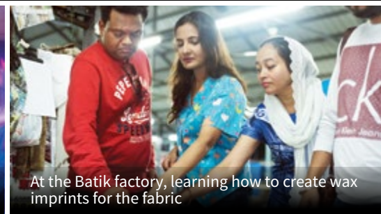
At the Batik factory, learning how to create wax imprints for the fabric