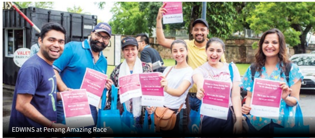
EDWINS at Penang Amazing Race