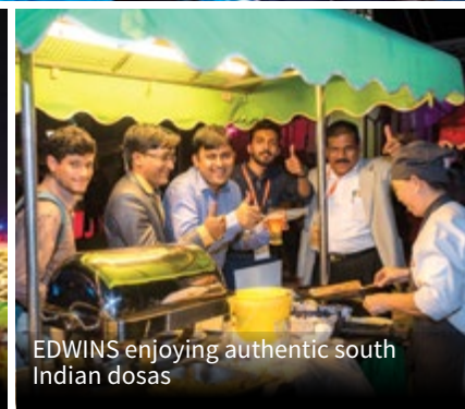
EDWINS enjoying authentic south Indian dosas