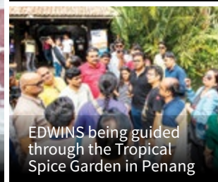
EDWINS being guided through the Tropical Spice Garden in Penang